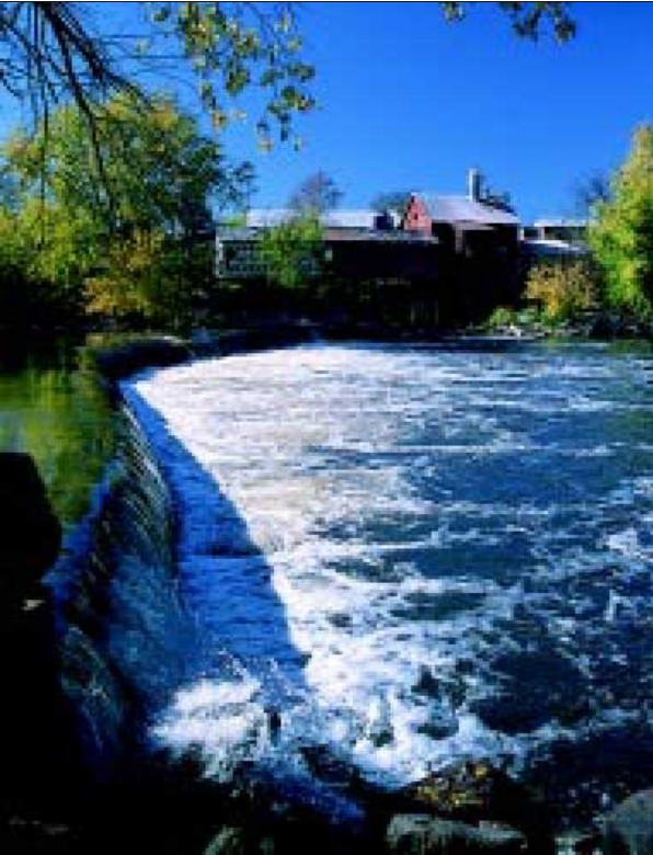
The Berning Mill Dam on the Crow River near St. Michael, MN was typical of a lowhead dam. Water flowing over the top creates a recirculating current drawing objects back toward the face of the structure. Even boats with powerful engines have been trapped and capsized by lowhead dams such as this one. The dam has now been removed as part of a state dam safety program.

An early fall storm had made the Susquehanna River unusually high. One evening, two rafters were swept over the Rock-bottom Dam and trapped in the current below the structure. Witnesses to the accident summoned help, and a rescue boat was launched with three firefighters on board. In the turbulent water, the craft capsized. All three were thrown into the river. One firefighter drowned; the other two, along with the two rafters, were pulled from the water.